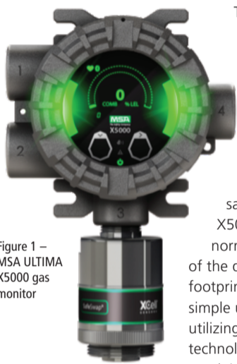
Figure 1 – MSA ULTIMA X5000 gas monitor

With the introduction of the MSA ULTIMA® X5000 and General Monitors S5000 gas monitors. For over 40-years, MSA has been the global leader in Fixed Gas and Flame Detection. With the addition of General Monitors in 2010, and our commitment to quality, we have developed the most advanced technologies to provide complete solutions for your gas detection needs.