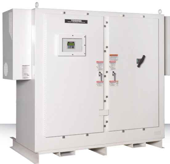
+ PLUS PACK

Toshiba produces award-winning low voltage drives ranging from fractional to 1500 HP and 230 to 690 V and medium voltage drives ranging from 300 to 10,000 HP and 2300 to 6600 V.