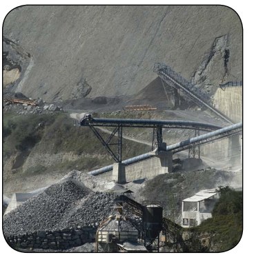
Mining & Minerals