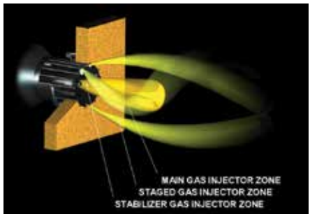
Advanced CFD modeling on every burner