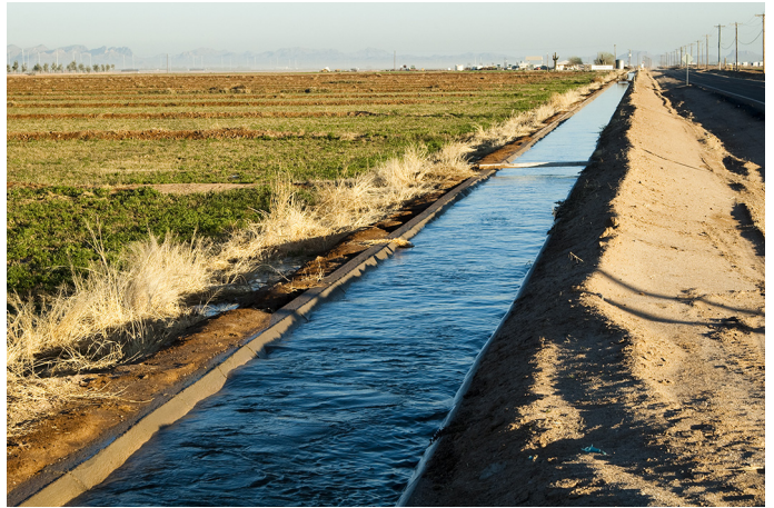
Fig. 2: Water flowing in an irrigation canal