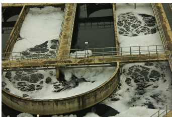
Fig. 9: Water recycling on sewage treatment station