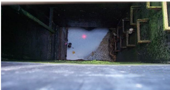
Fig. 1: Laser measuring sewage levels