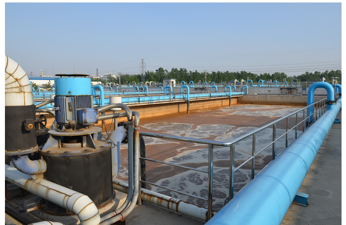
Fig. 5: Aerated activated sludge tank at a wastewater treatment plant