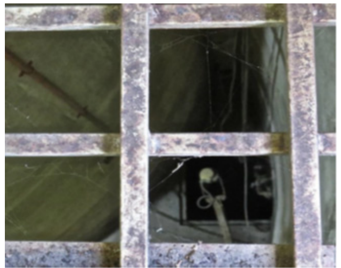
Fig. 4: Water pumping station