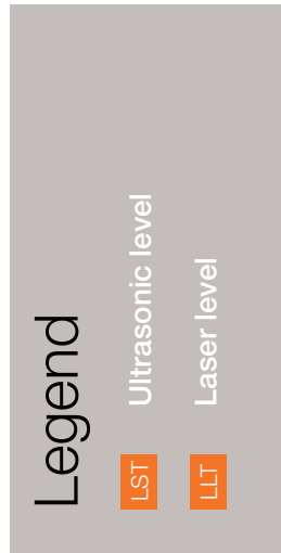
Fig. 7: Waste water