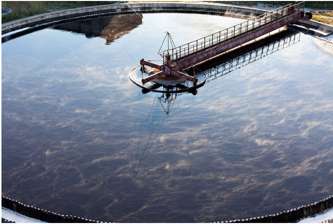
Fig. 8: Purification in tank by biological organisms