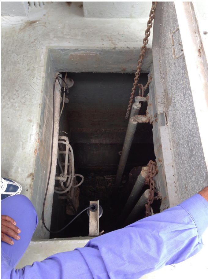
Fig. 3: LST400 in sewerage plant