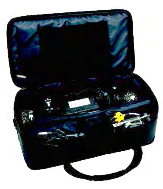
Standard soft shell carrying case