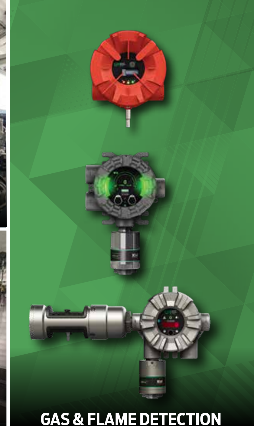
GAS & FLAME DETECTION