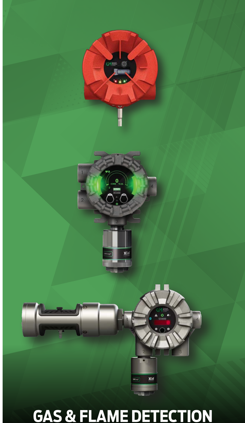
GAS & FLAME DETECTION

Ultrasonic Flow Metering including In-line & Clamp-on for Gas/Liquid Service, Flare Metering, Moisture & Gas Analyzers